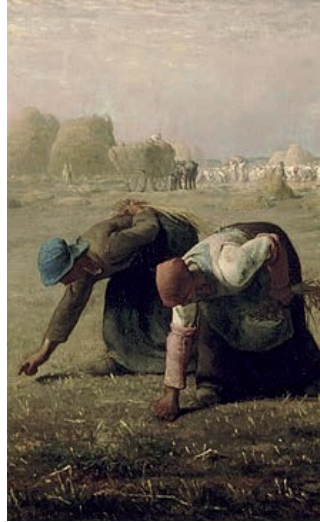
The Gleaners (1857) | Realist artists sought to depict the world as it really was with a focus on ordinary people.