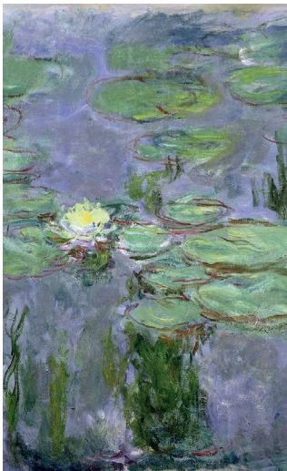
Water Lilies (1915) | Impressionism captures the fleeting moments of modern life using vivid colours.