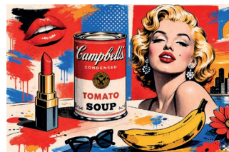
Andy Warhol-Inspired (2026) | Pop-art sought to elevate popular culture.